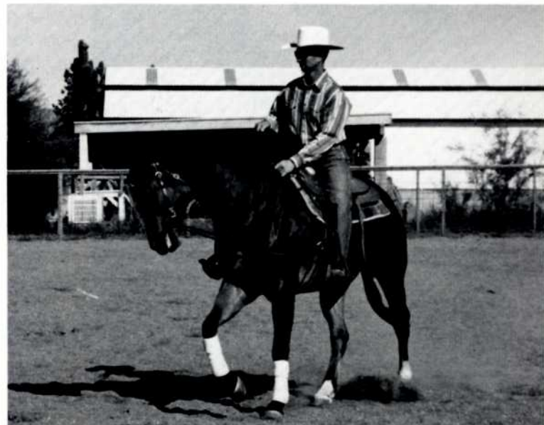
...and loping to the right, he moves the head in and the shoulder out.